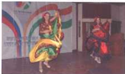
Russian students performing at the event

Under the Indo-Russian Students' Festival of Friendship, a grand cultural programme of Music & Dance was organised at IIT Bombay on November 21, 2008. A 50-member student group representing leading universities in Russia entertained the audience with scintillating performances and the P.C. Saxena Auditorium was packed to capacity.