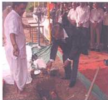
Dr. Anil Kakodkar performing the groundbreaking ceremony

The groundbreaking ceremony for the Bio-School building and Lecture Hall Complex was performed by Dr. Anil Kakodkar, Chairman, Board of Governors, IIT Bombay on November 18, 2008. Other members of Board of Governors were also present on the occasion.